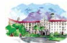
GROOTE SCHUUR HOSPITAL