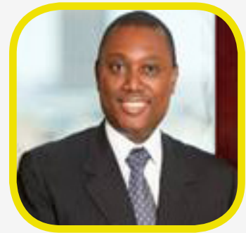
Simphiwe Tshabalala CEO, Standard Bank